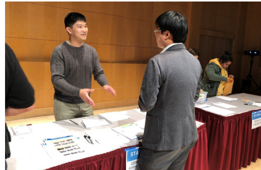
Mt. San Antonio College, Walnut November 29, 2018