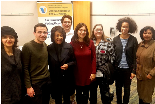
Redondo Beach Library December 6, 2018