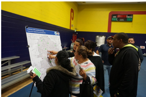
Salvation Army, Compton November 16, 2018