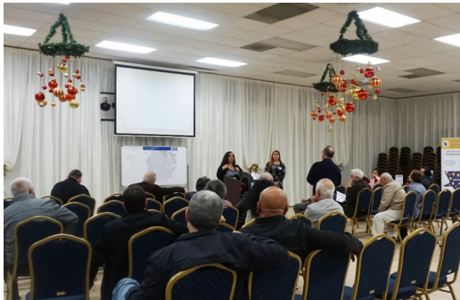
H&H Jivalagian Youth Center, Pasadena December 13, 2018