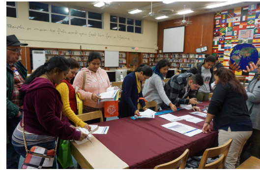
Long Beach Polytechnic High School December 5, 2018