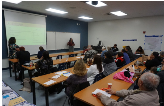
University Center of Lancaster December 12, 2018