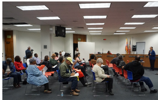
Inglewood City Hall December 12, 2018