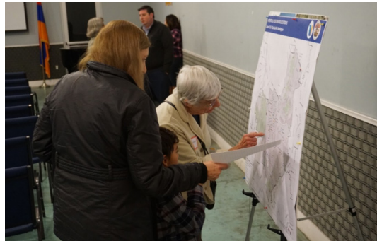
Glendale Youth Center December 14, 2018