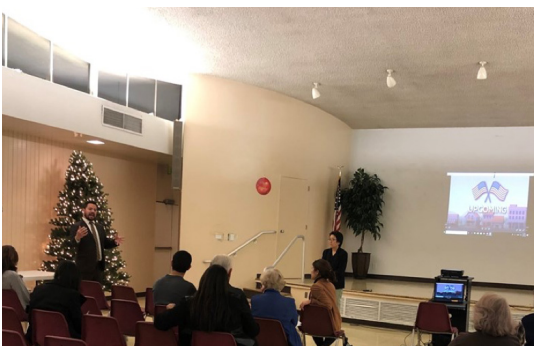
Albert O. Little Community Center, Artesia December 4, 2018