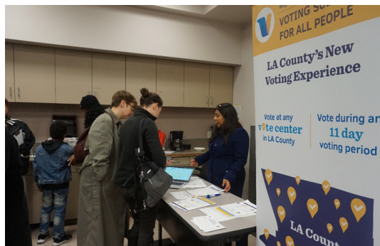
Los Angeles Fire Station, North Hollywood November 29, 2018