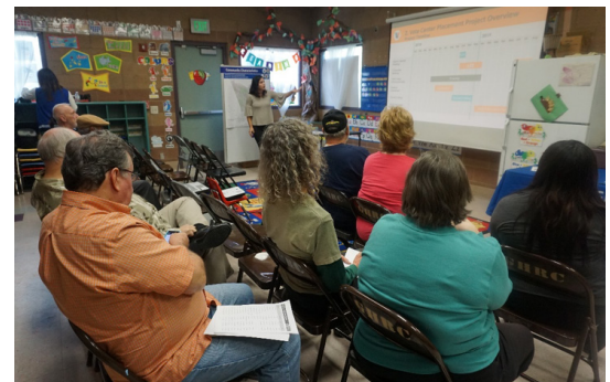
Petit Park, Granada Hills Recreation Center November 17, 2018