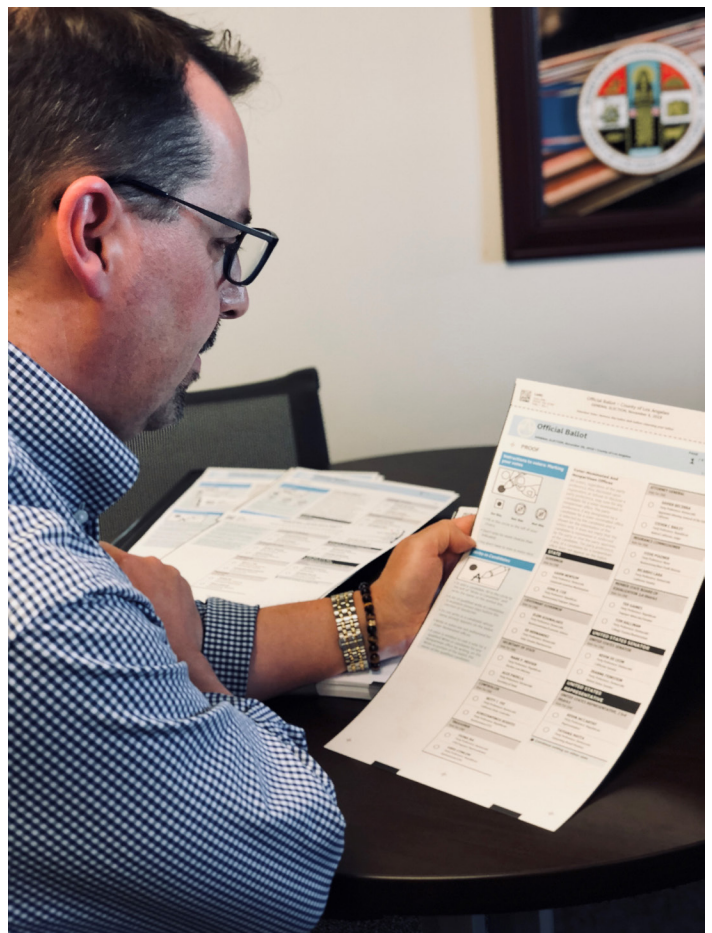
Registrar-Recorder/County Clerk Dean Logan with the new VBM ballot design

In total, the RR/CC processed 1,350,313 VBM ballots, the highest number of VBM ballots in any election!