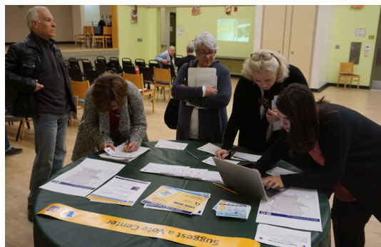
Sherman Oaks East Valley Adult Center December 3, 2018